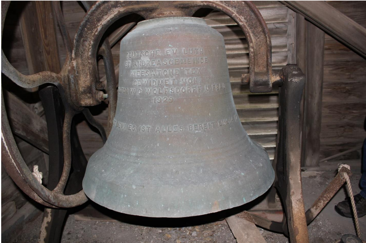
Figure 3: Bell with dedication to Pastor Wolfsdorff written in German, installed in 1929.

It also says in German, “Come for it, every ring is ready.” 30