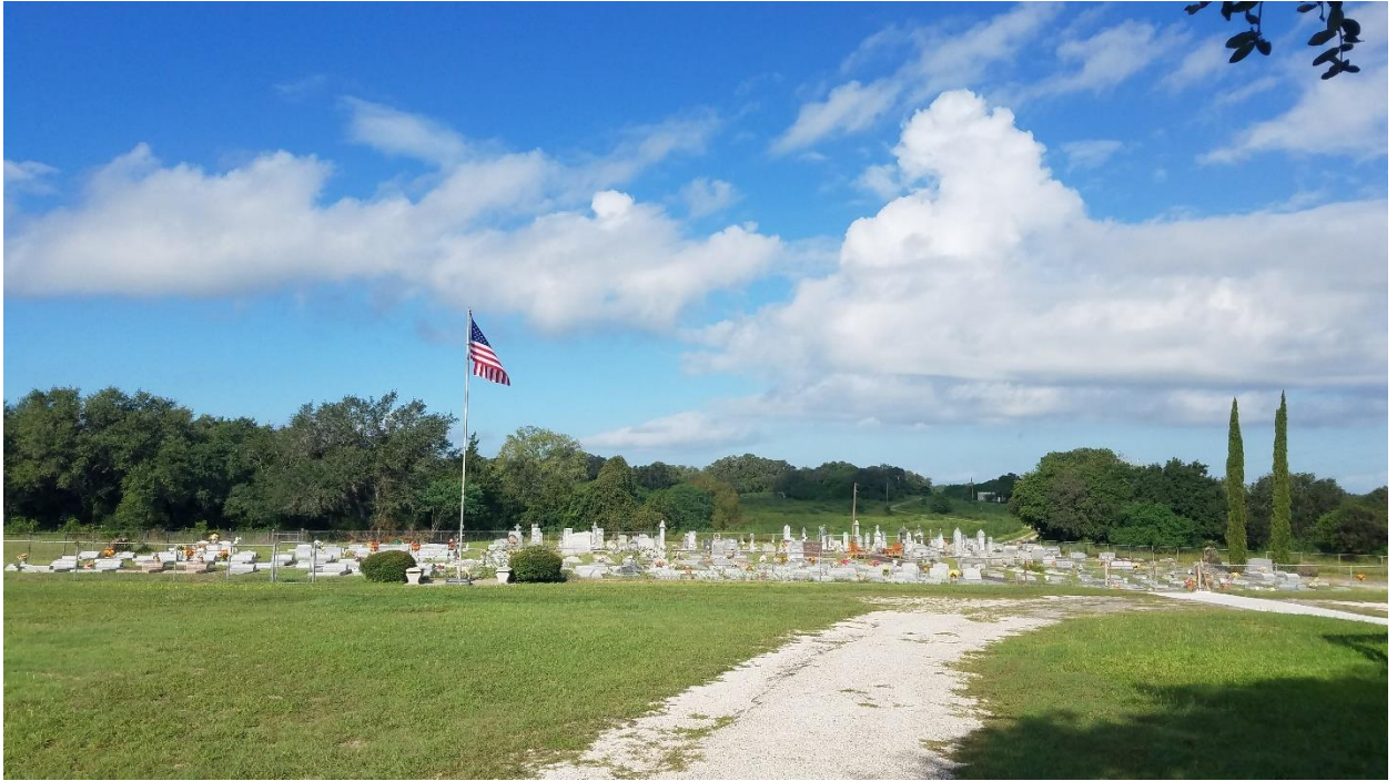
Figure 5: St. Andrew's Lutheran Church Cemetery 32