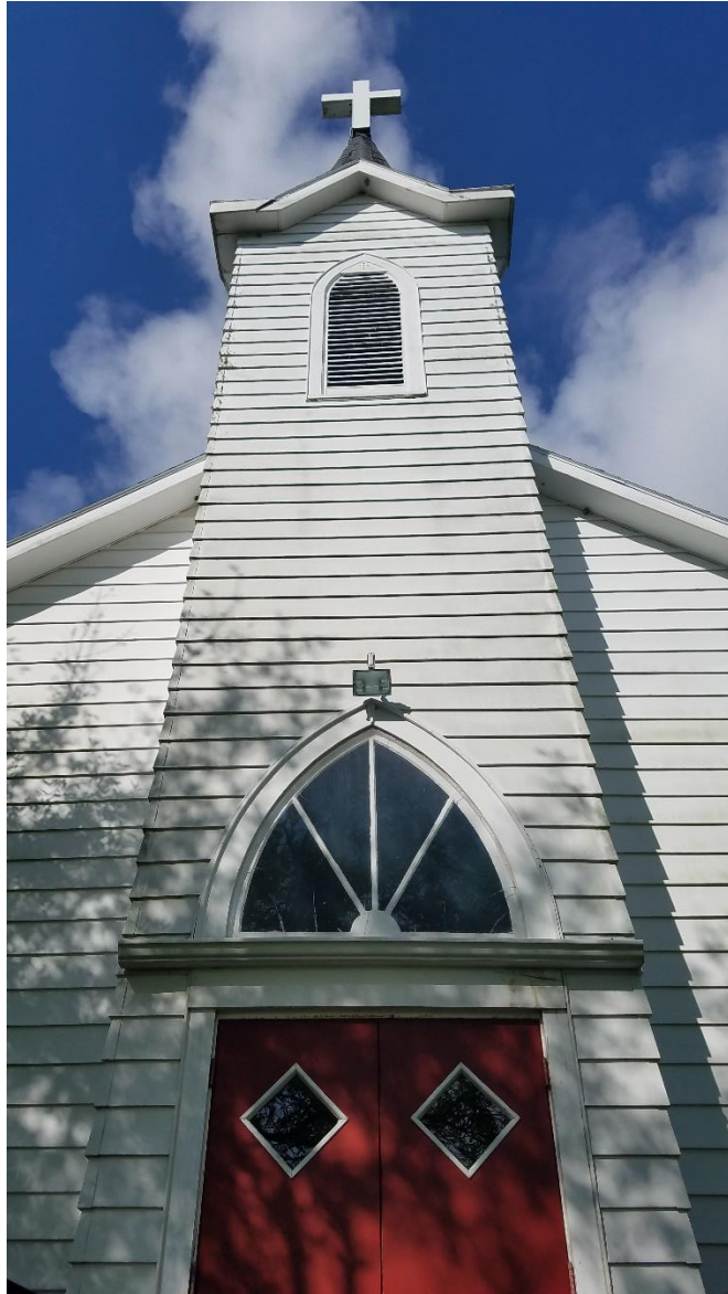
Figure 4: Front of St. Andrew's Lutheran Church 31