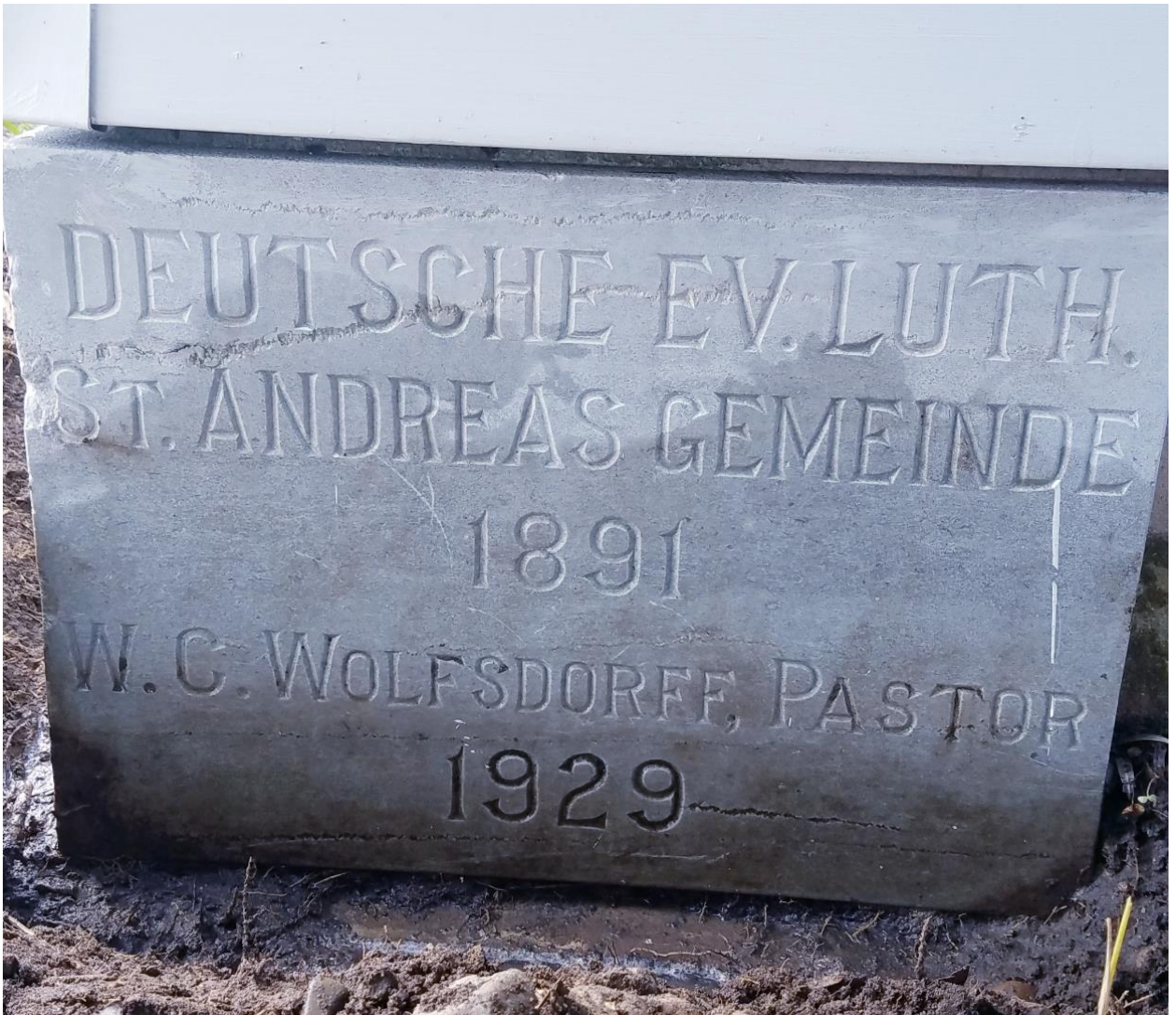
Figure 7: Other side of the cornerstone. 34