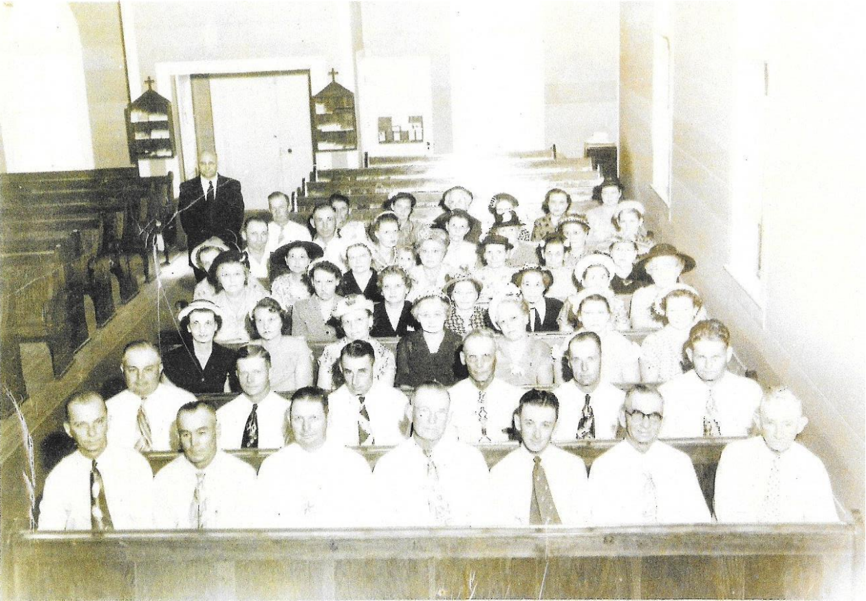
Figure 2: 1952 about half of the Bible study group 29