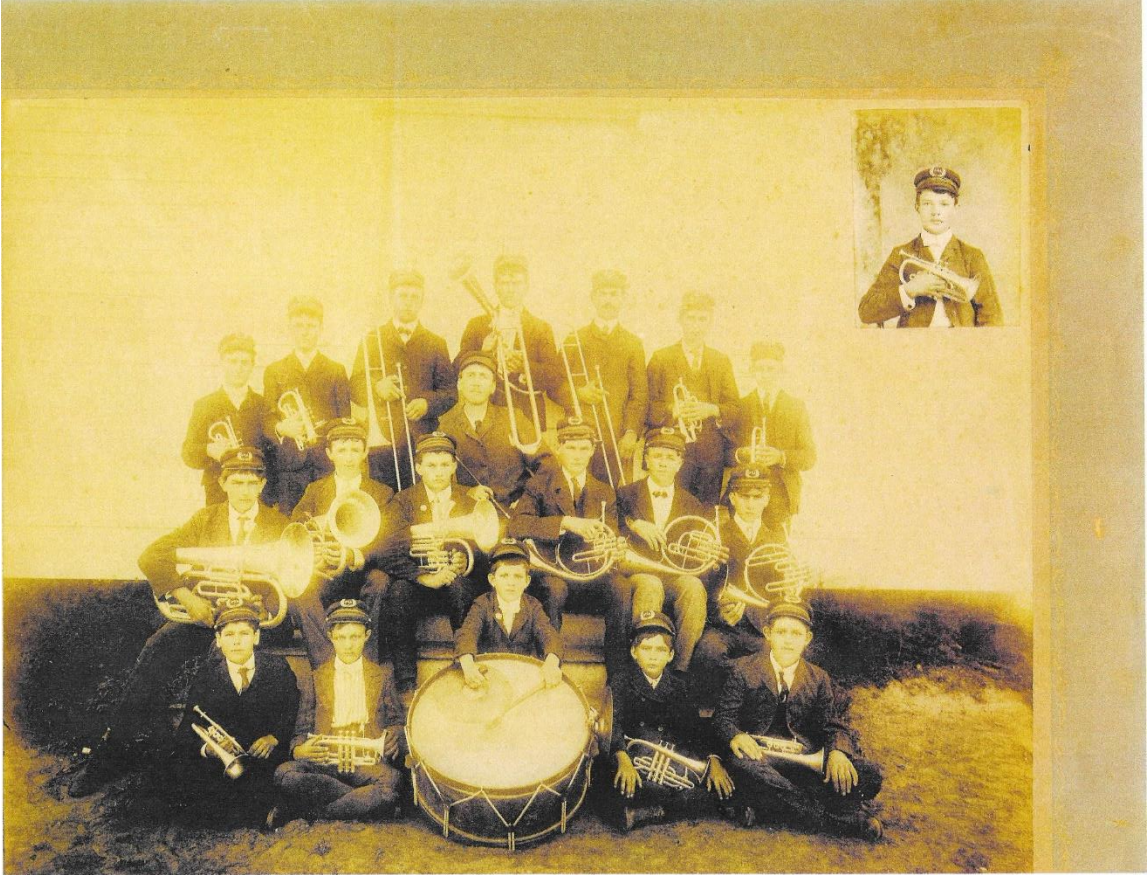
Figure 1: Early 1900s, Weesatche, TX band consisting of members of St. Andrew's Lutheran Church 28